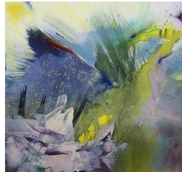
"All at Once"

Bottlehouse- Madrona 1416 34 th Avenue Seattle, WA 98122 Reception: October 22 nd 3-5:00 pm