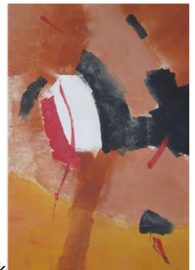
Split Second – Lois Beck