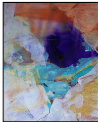
Looking Out – Mia Schulte