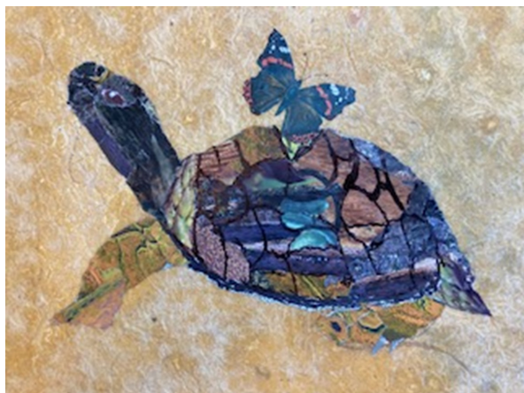
Lois Beck's collage "Terrance"-10" by 16"