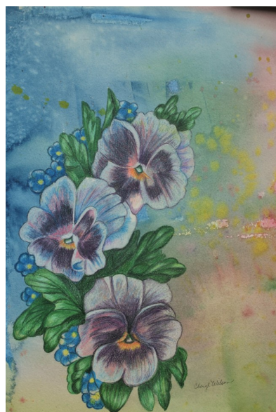
Cheryl Wilson's colored pencil and watercolor Pansies 15" by 13"