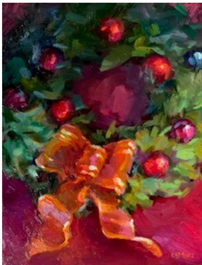
Gold Ribbon Wreath