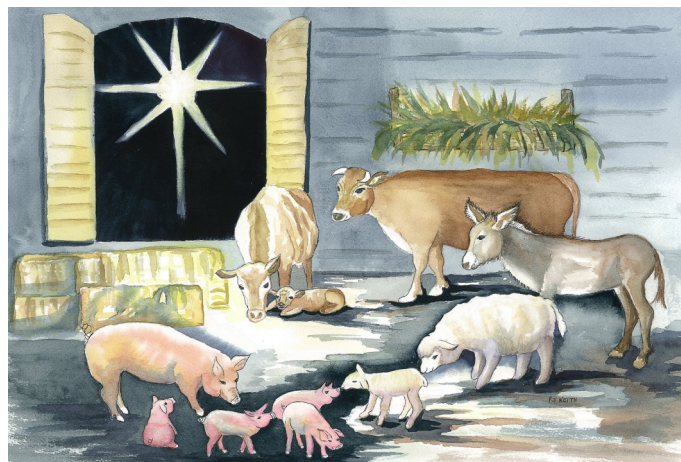
Peace on Earth