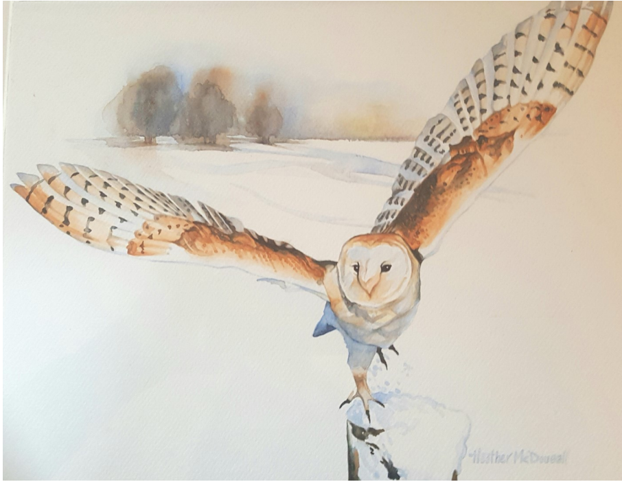
On Winter's Wing