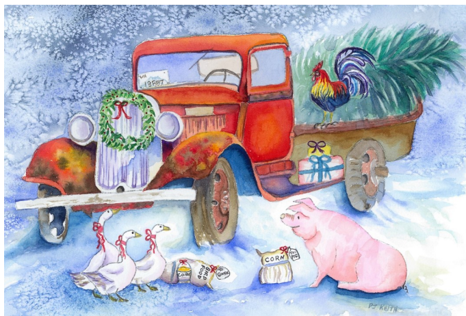
Geese and Pig Exchange Christmas Presents