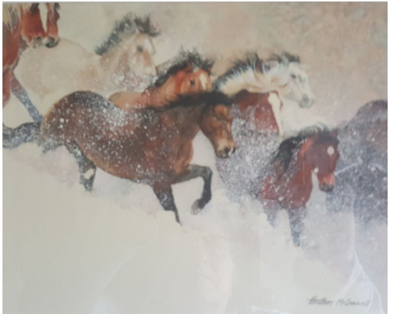
Down Hill Run